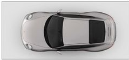
UNDERCOVER CAR SPACE 5.6 x 2.5m